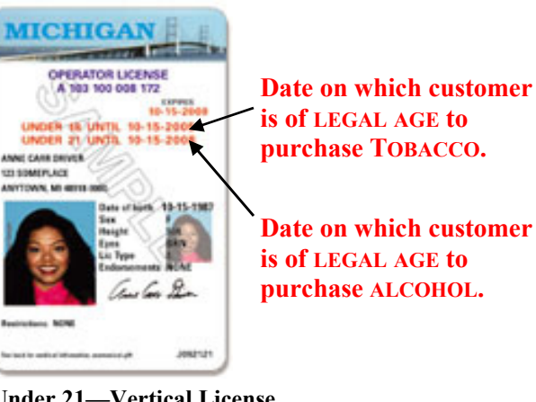
Under 21—Vertical License