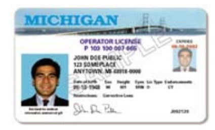
Age 21 and over—Traditional Horizontal License